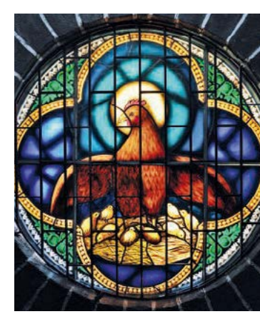
left) surrounds the stained glass windows, an example of which (above) shows a plaques left by the grateful recipients of miracles cover