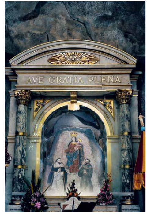
Previous pages: a large plaza in front of the ntrance to Las Lajas actually the top of the oridge that spans the ravine, as can be seen from afar on page 59 and from below on this page (left). The vaulted ubstructure supports the church, of course, but also contains the chapel and a museum. Above: the church has been built directly into the

mountainside, so its front wall is the craggy rockface where the miraculous image of the Virgin Mary holding baby Jesus appeared. The image is now surrounded by a splendid niche and the altar stands in front of it. portraits of past priests of the church are seen above the entrance doors on the ornate white and dark gray granite facade