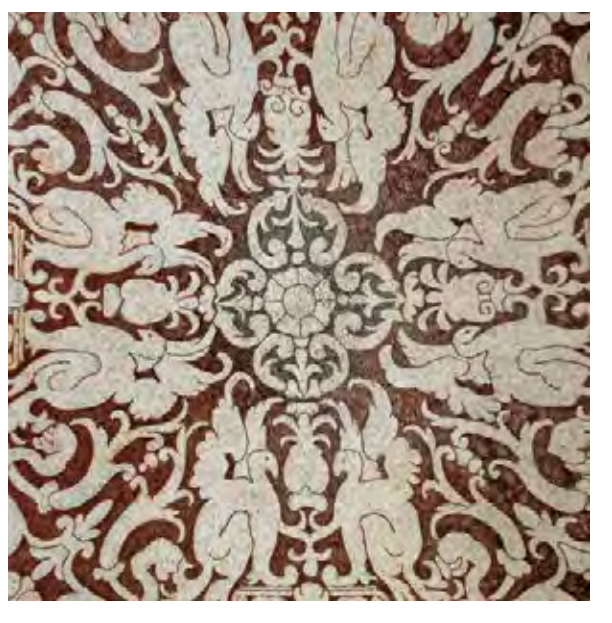
This page and opposite: on floors, walls, and ceilings, the black limestone and white quartz mosaics, symmetrical designs of metric and floral motifs oday look far more modern than their age. The creator of the majority of the nosaics was Camillo Procaccini (1561–1629), an artist who came from Bologna. The black-andwhite features are complemented by gray-veined limeston loorway jambs as well as shutters that have been ainted a deep green